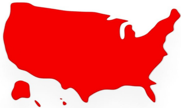
UNITED STATES OF AMERICA (USA)