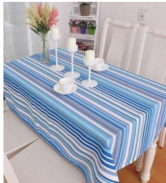
HOME TEXTILE DIVISION